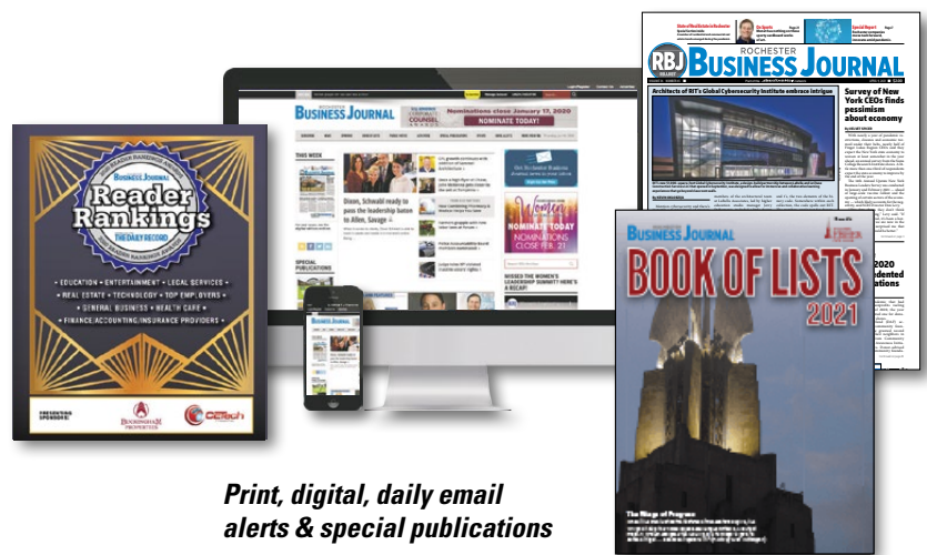
Print, digital, daily email alerts & special publications